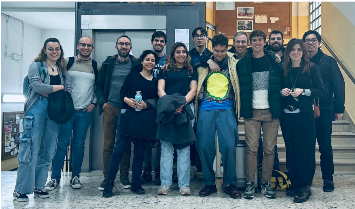
Figure 3. Illustration of a session from the S2 Scientific Training.