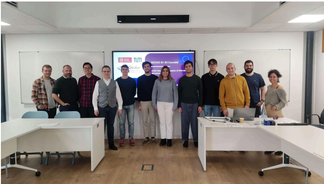
Figure 2. Illustration of a session from the S1 & S3 Scientific Training.

The video recordings of the open sessions are available on the project website, while recordings of the private sessions are accessible in the shared project folder for team members. This comprehensive training provided participants with both theoretical knowledge and practical implementation skills using state-of-the-art tools and methodologies in Isogeometric Analysis (IGA). The agenda and list of participants for these training sessions can be found in the Annex 4.1.